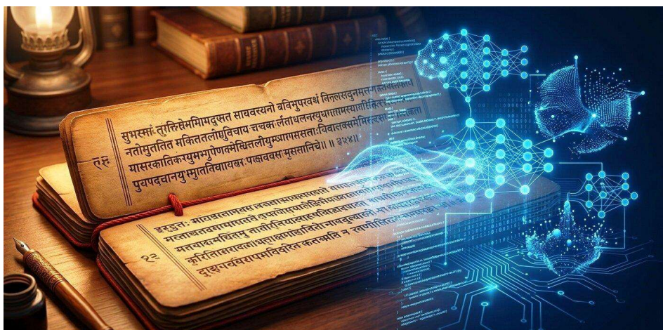
Figure 2: Convergence of Ancient Indian Knowledge and Artificial Intelligence, A Civilisational Opportunity (Illustrative)

universities found that 58% of postgraduate students associated IKS primarily with religious content rather than scientific or intellectual heritage, reducing their receptivity to its curricular inclusion. Conversely, when IKS content was delivered through interactive digital formats—gamified quizzes, documentary films, virtual museum tours—the same cohort demonstrated a 43% improvement in engagement scores. This finding positions digital pedagogy not merely as a delivery mechanism but as an attitudinal corrective.